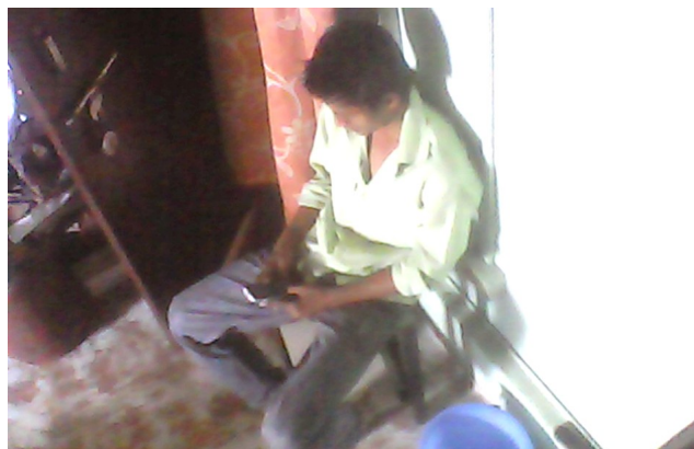
Figure 1: A worker in India completes OCR tasks on his cell phone using MobileWorks.

Copyright © 2011, Association for the Advancement of Artificial Intelligence (www.aaai.org). All rights reserved.